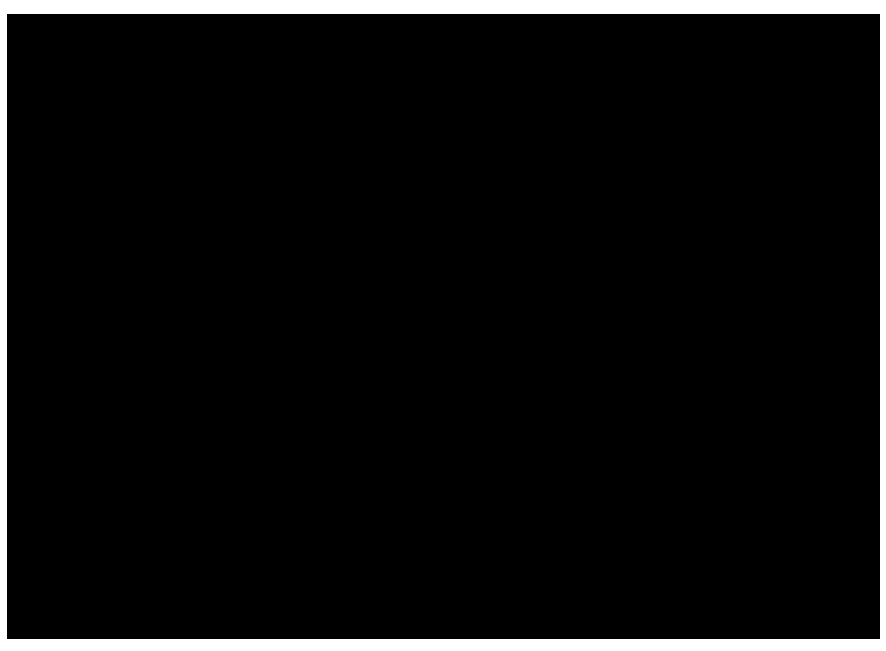
MS ELLIS: Can I take you to page 28 of Exhibit 70.---Ah hmm.